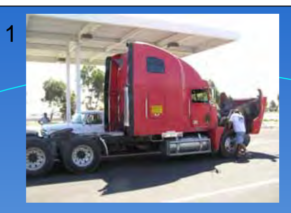
First Diesel Oxidation Catalyst Installation

Primera Instalación de un Catalizador de Oxidación